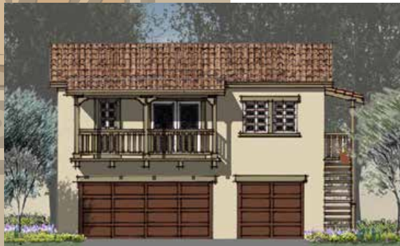
Carriage Unit I