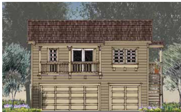
Carriage Unit II

Nino Homes offers a very unique opportunity to own a home with a second residence located over the garage. The carriage apartment is a completely separate unit. This cozy space features an open floor plan with sunny living/dining space connected to the kitchen, a nice covered balcony, and a large bedroom with two closets and private bath. Underneath, there is a two car garage for the main unit and a single car for the carriage unit.